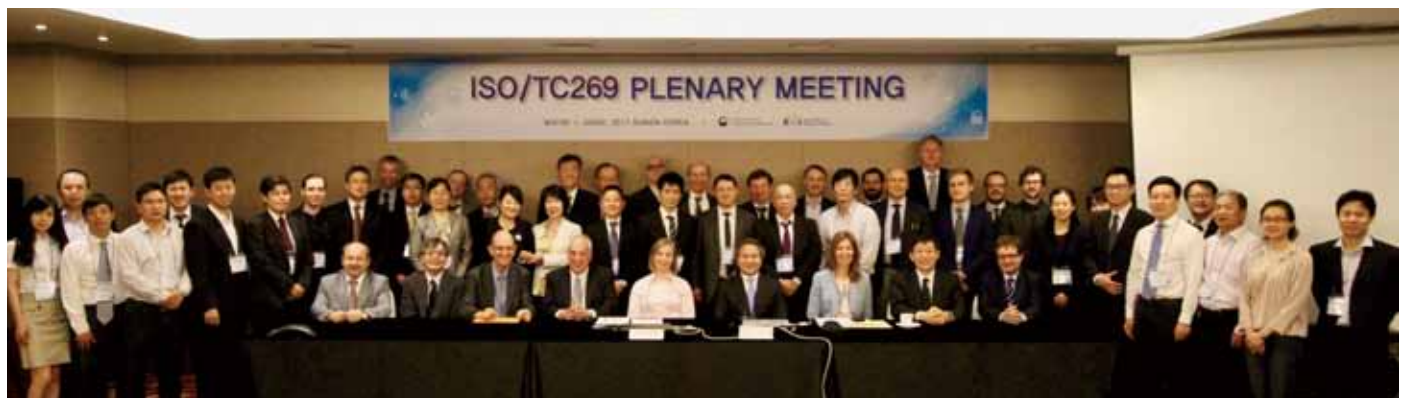
Fig. 2: Participants of the 6th Plenary Meeting in Suwon, Republic of Korea in June 2017

I would like to try to develop ISO standards for Railway Applications together with my colleagues of ISO/TC 269 under the ISO policy of “Global relevance.”